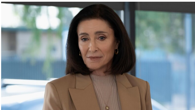
Rita Tedesco learns that Preston Borders died and the police are now after her.

The episode begins with the police wrapping up the Sheila Walsh crime scene. Harry Bosch tells one of the investigators that RHD should be working the case because the guy who did this already disappeared an entire family. The investigator says that he heard the family fled to Mexico. Bosch tells him that is what Finbar McShane wants people to think. Bosch offers his assistance but the investigator doesn't seem too interested. Elsewhere, Finbar is shown getting in a cubbyhole in the back of a commercial truck.