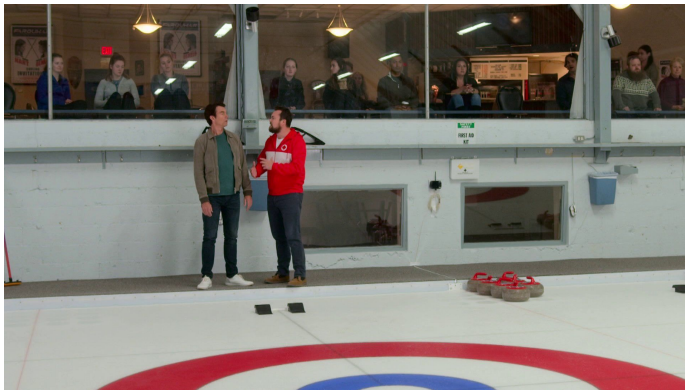
Harley, Sam and Dave hit the rink to solve a mystery at the local curling club.