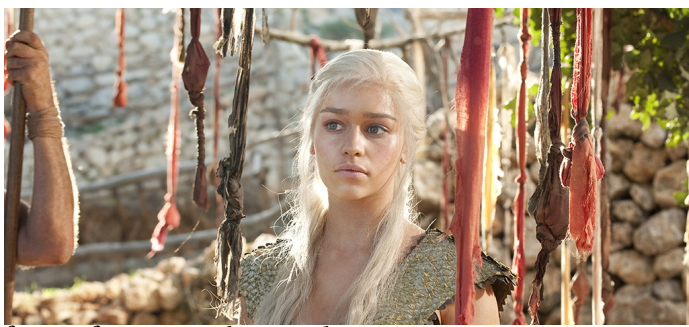
fronts four armed men alone.

to conquer Westeros with Drogo's savagery.