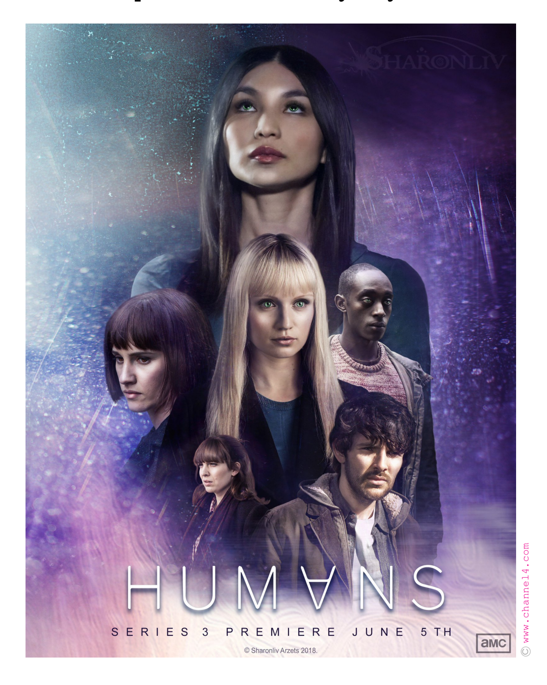
Episodes 001–024 Last episode aired Thursday July 5, 2018