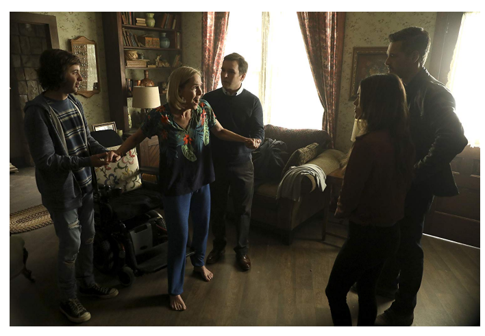
help but wonder if the truth is out there.

Sam and Eddie travel to California's wine country to investigate the mysterious disappearance of a wheelchair-bound woman.